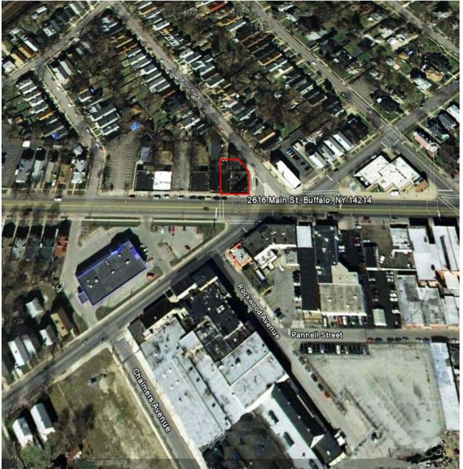
Aerial View of 2616 Main Street